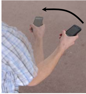
Fig. 1. Scanning the environment by pointing and turning

closer to her face. Therefore, tilting the device in a more upright position as depicted in Figure 2 disables the scanning mode, i.e. the application ignores further changes of the device's location and orientation in order to allow additional interaction with the currently visible ambient cloud.