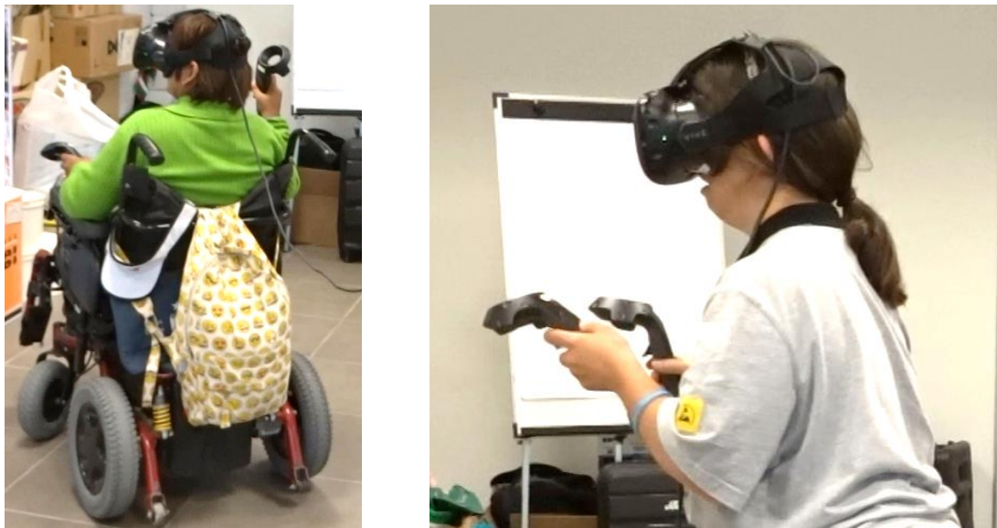
Figure 4: First experience in a VR training session. Left: a worker with lower body motion impairment, utilizing a motorized wheelchair. Right: a worker with cognitive disability (Down syndrome)

One of the primary roles of virtual reality (VR) in the factory of the future is the training of human workers in new jobs and procedures. We conducted training sessions with WCDs who had not previously used VR. We found that the behaviour and reactions of workers with a range of disabilities were comparable to the reactions observed in the general population. The more challenging experiences in fully immersive environments were related to teletransportation, although most learned to understand it after dedicated one-to-one instruction. In some cases, the interaction of real objects and people that did not appear in the virtual scenario was reported to be disconcerting. This means that such external objects need to be introduced carefully to begin with. We also observed great resourcefulness from a participant on a motorized wheelchair (Figure 4, left), who did not have difficulties when leaving one of the controllers on her lap (and thus the hand visualization in the virtual world) to have her hand free in the real world and move her wheelchair around.