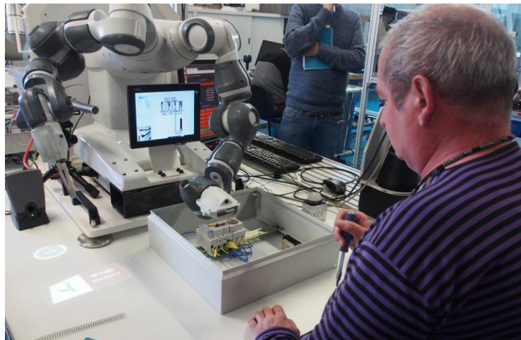
Figure 1: Worker with intellectual disabilities assembling an electrical cabinet in collaboration with a cobot. The robot checks the cables the worker has just connected and informs the worker if an error is found, giving them an opportunity to correct it.

LANTEGI BATUAK, Spain, miguelmartin@lantegibatuak.eus