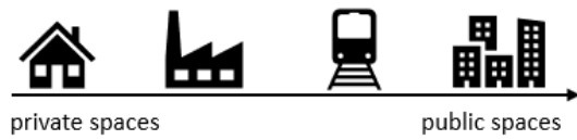
Figure 3: Scale of contexts from private spaces to public spaces

Streitz and Wichert [16] describe the dimension of contexts also as spaces and places "where the interaction happens, where services are provided or being used and their operating range in terms of proximity, being close or distant." The contexts range from private to public spaces such as the bathroom, the office to the smart home, factory, market place, train station, neighbourhood and entire countries [16] (see Figure 3).