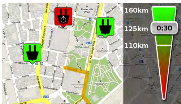
Figure 1. One design mockup includes a slider for specifying the charging duration and the expected range.

First mockups included a slider concept as a visually appealing way to specify this information. The variant in Figure 1 focusses on specifying the driving range with the slider. Its bar shows the estimated charging duration for the selected range as soon as the user lifts his finger. Whereas this combined slider display of range and duration seemed beneficial at first sight, we identified several drawbacks while further elaborating on the concept. First, experiments with related touch-based slider controls on mobile devices showed their inaccuracy for such fine-granular settings. Thus, we decided to go for more traditional spinner controls. Second, specifying the expected range forces the user to park his EV at the particular charging station for the calculated duration. Since we target a comfortable solution avoiding any major adaptations of users' mobility behavior and thus to increase the acceptance of EVs, we agreed to focus on the actual parking duration: drivers typically know how long their vehicle will stand at the parking spot (e.g. during a shopping tour or a restaurant visit, etc.). They probably will not change such routines and extend the parking duration to reach a specific battery level or range.