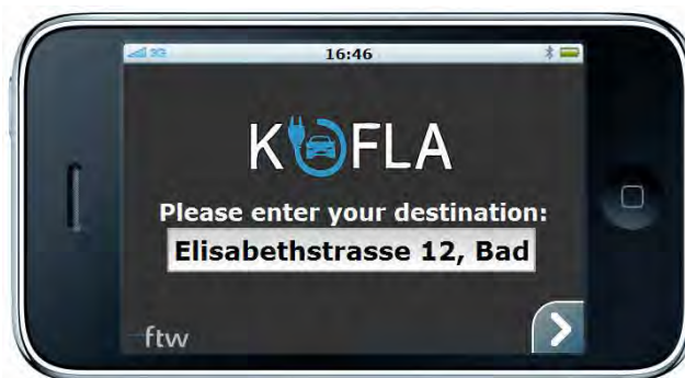
Figure 2: Simple form for entering the destination.

Our prototype is based on traditional Web technologies such as HTML, JavaScript, and CSS. For displaying maps, visualizing points-of-interest and providing a routing feature we integrated the respective services offered by the Google Maps JavaScript API [8] and the Google Directions API [7]. We made use of the Yahoo! User Interface Library [15] for integrating sliding and fading effects to closer resemble the look-and-feel of a native mobile application. Further, we designed some custom icons and symbols to embellish the interface.