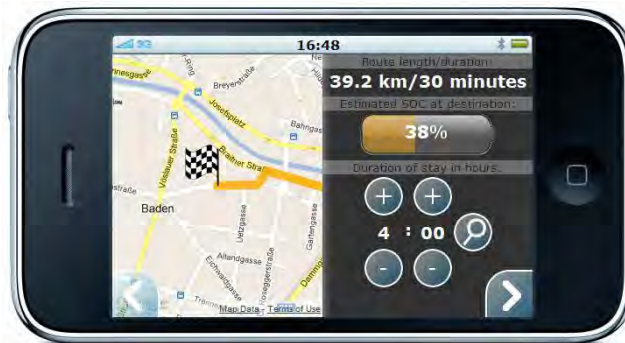
Figure 3: Specifying the duration of stay.