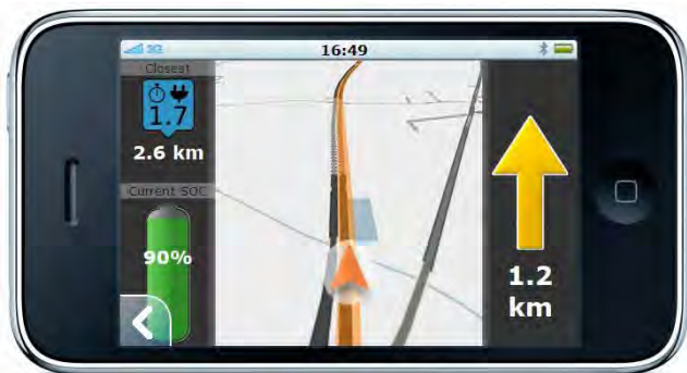
Figure 7: Traditional navigation leads to the charging station while the distance of the closest charging station is shown.

Figure 2 shows the start screen of the application. The user is asked to enter the street address of his destination and confirm by touching the bottom right button. In analogy to a traditional navigation solution, the user is informed about the route length and estimated duration on the succeeding screen (Figure 3). The adjacent map view shows the area around the destination location. Additionally, the application displays the estimated SOC at the destination in form of a battery image to illustrate the charging demand. The planned duration at the destination may be entered by specifying the respective hours and minutes through the plus and minutes buttons (native mobile applications may use available spinner controls). By pushing the search button (with the magnifying glass) the application starts looking for charging stations which are available at the calculated time of arrival and are located within walking distance from the specified destination. In the current version of the interactive prototype number and locations of charging stations are locally generated on a random base.