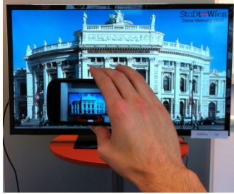
a) Display pointing