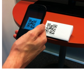
b) QR code