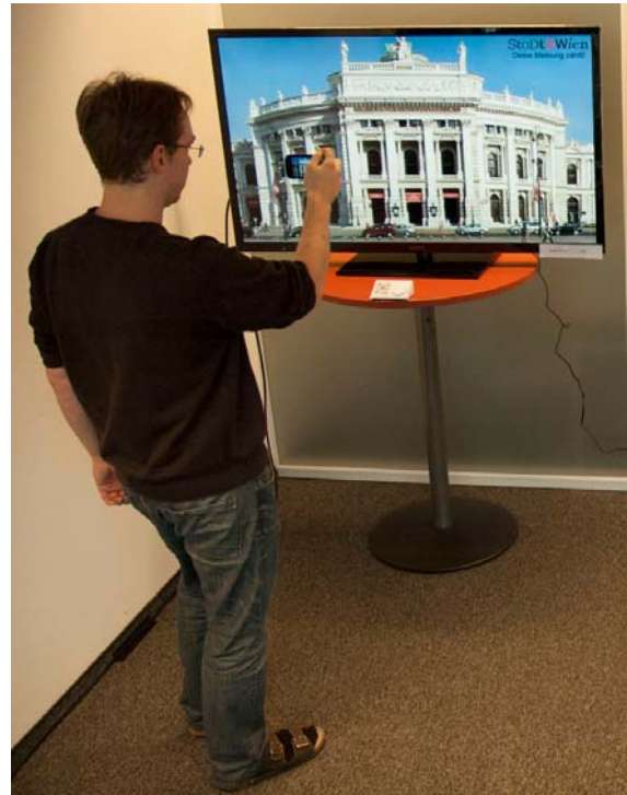
Figure 2: A test person trying to establish a connection to one of the study screens by display pointing.

While these examples utilize camera-based approaches for special interaction styles and for dedicated tasks on a remote display, none of the previous work focused on the investigation of a generic technique for setting up the required data connection.