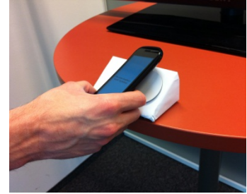
c) NFC tag